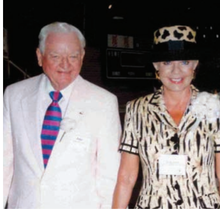
play their cotton attire as Wear Cotton Winners in dresses at the 2000 Annual Meeting Fashion Show.