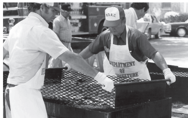
1983 Annual Meeting; Mississippi Department of Agriculture and Commerce prepares the Mississippi farm raised fried catfish lunch on the DSU Quadrangle