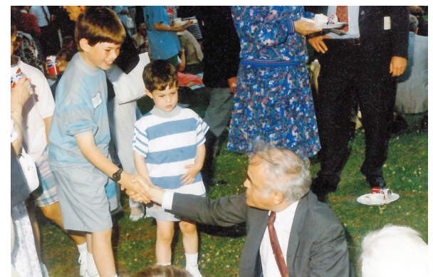
1999 Annual Meeting Keynote Speaker Robert Novack , Co-Host of CNN Cross Fire, greets children during the catfish luncheon on the DSU quadrangle