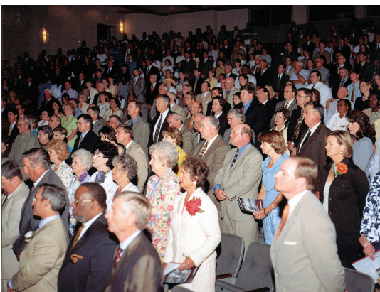
1997 Annual Meeting Business Session at Delta State University's BPAC