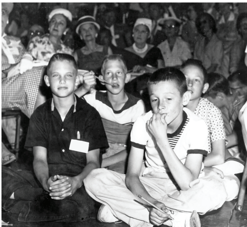
Students listen to the 1957 Delta Council Annual Meeting Keynote Speaker Harvey Firestone, Jr. , Chairman and Executive Officer of The Firestone Tire and Rubber Company.