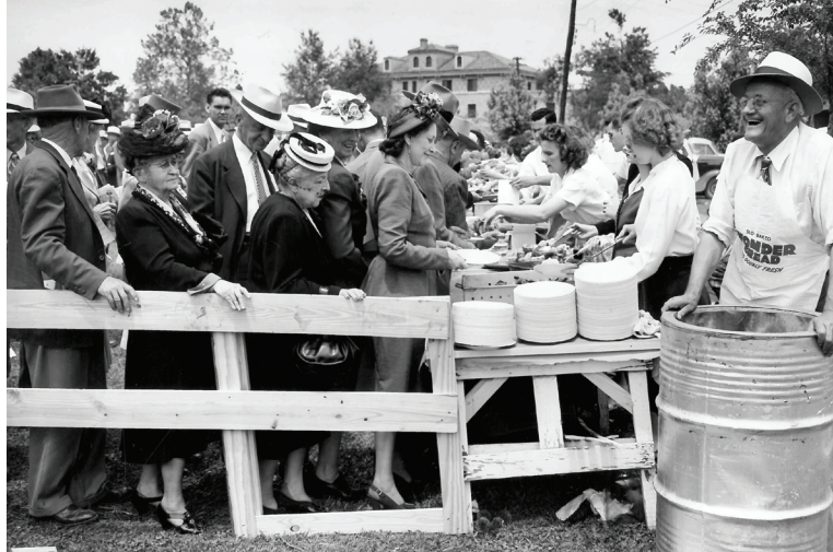
Hungry guests line up for the 1947 Annual Meeting luncheon