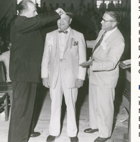
Clothing Contest Presentation.