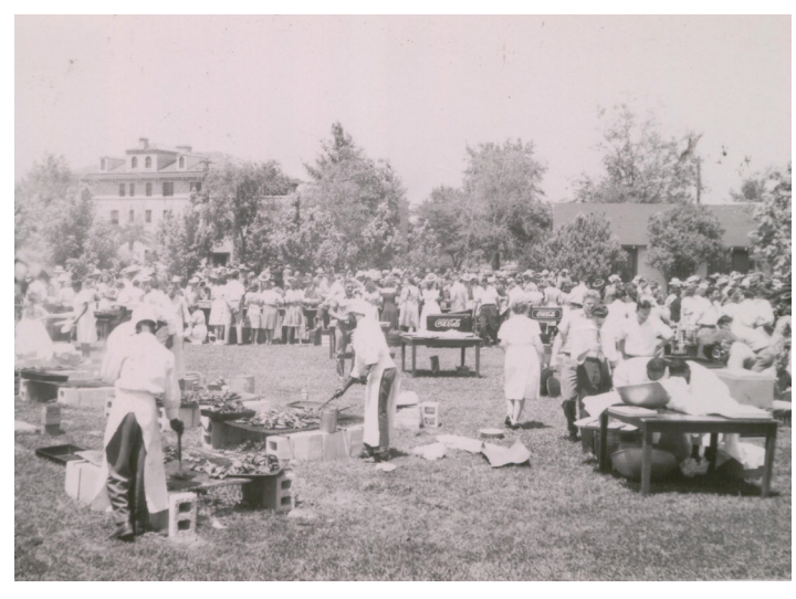
1946 Annual Meeting Luncheon — First meeting after World War II.