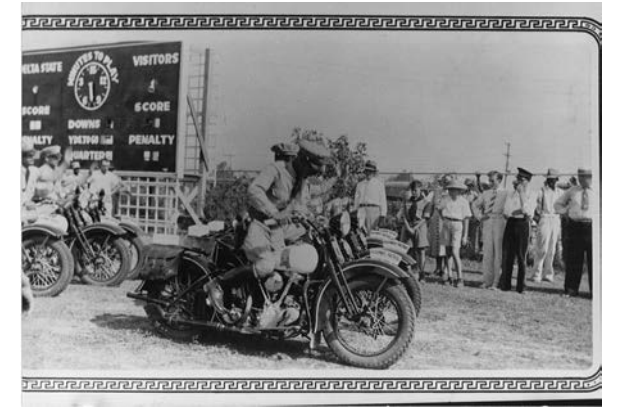
The Mississippi Highway Patrol show off their new motorcycles at the 1938 Annual Meeting of Delta Council at Delta State University.