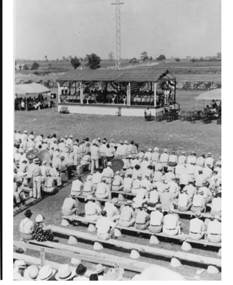
The 1938 Annual Meeting of Delta Council was held on the football field at Delta State University, then Delta Teachers College.