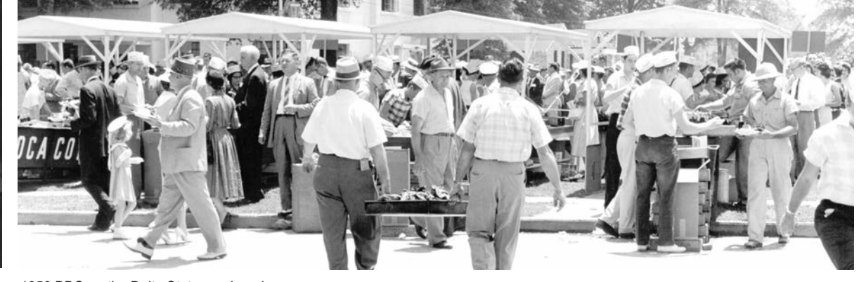
1958 BBQ on the Delta State quadrangle