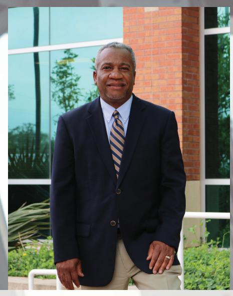
Outstanding Contributions to Aquaculture:

United States Department of Agriculture Agricultural Research Service Stoneville