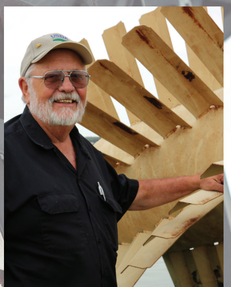
Researcher of the Year: