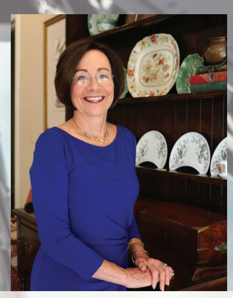
Good Middling Community Service Award Recipient:

United States Department of Agriculture Agricultural Research Service Stoneville