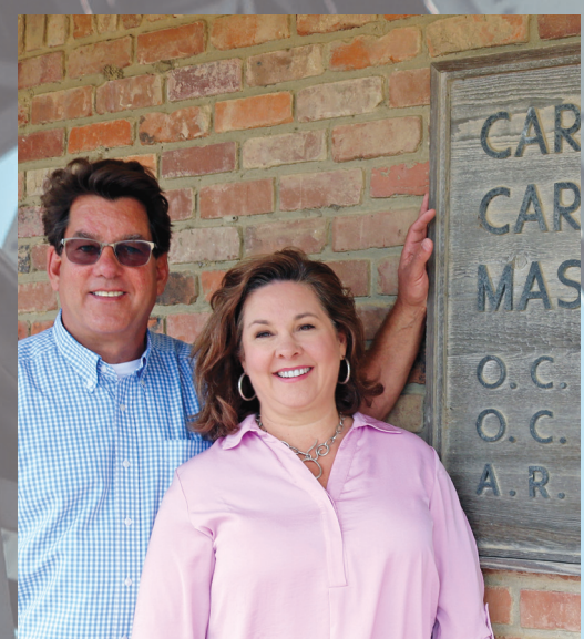
Outstanding Soybean Producer: