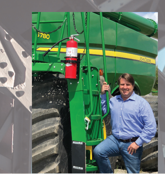
Outstanding Rice Producer: