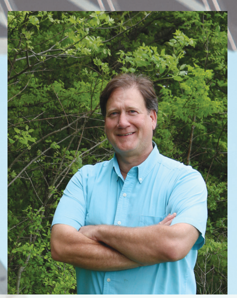
Outstanding Contributions to Hardwood Forestry: