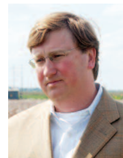
Lt. Governor Tate Reeves Master of Ceremonies