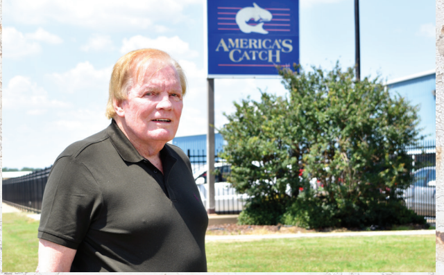
Outstanding Contributions to Aquaculture: