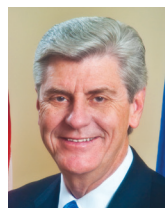
Governor Phil Bryant

Throughout March, multiple information meetings were arranged in the South Delta to address the history, impacts, and solutions to the backwater flooding. Governor Phil Bryant and all of our federal delegation