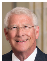
Senator Roger Wicker

– Congressman Bennie Thompson , Senator Cindy Hyde-Smith , and Senator Roger Wicker – have toured the impacted area and voiced