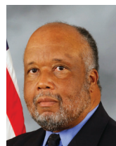
Congressman Bennie Thompson