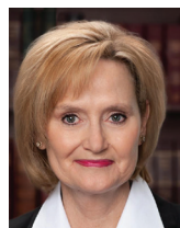
Senator Cindy Hyde-Smith