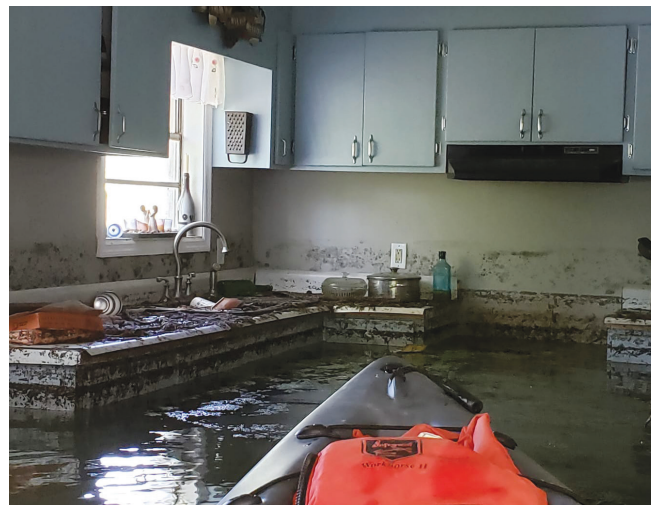
Flooded home on Floweree Road, south of Valley Park

“This year’s flood is a case study on why the Yazoo Backwater