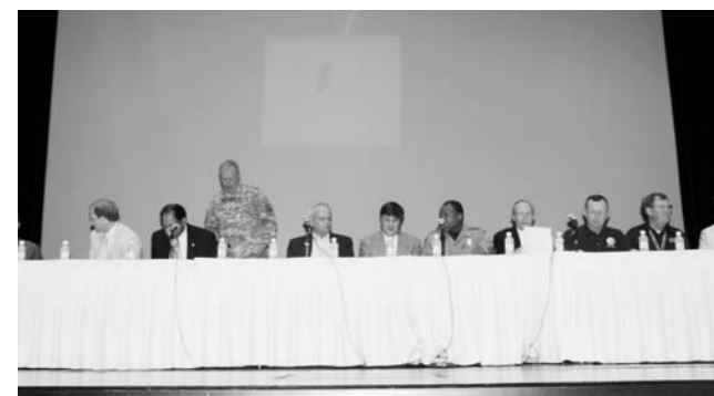
The 2011 Annual Meeting was altered to allow state and federal agencies to address the historic 2011 Flood.