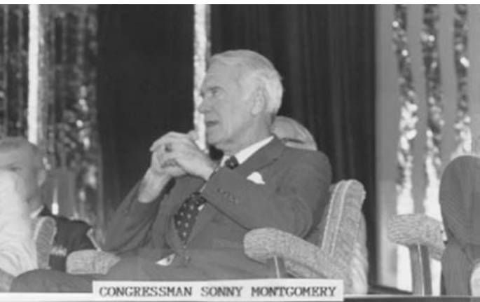
1983 Annual Meeting Congressman Sonny Montgomery