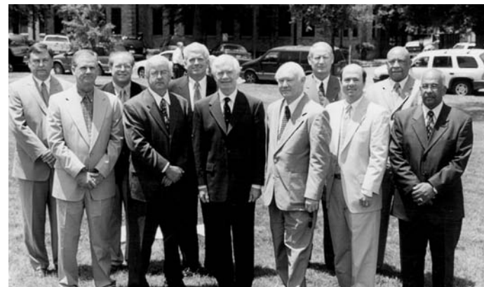
Senator Thad Cochran is surrounded by 2000-01 and 2001-02 Officers of Delta Council.