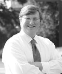
Lt. Gov. Tate Reeves