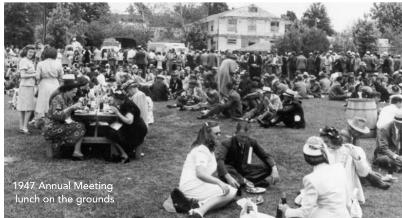
1947 Annual Meeting lunch on the grounds