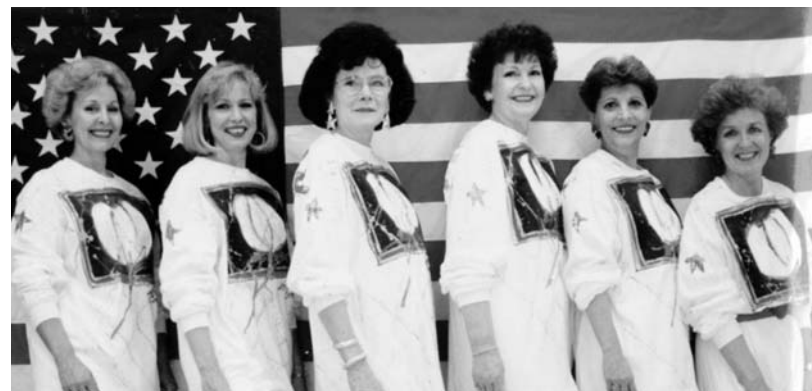
A Fashion Show from the 1990's. Can you identify the year and all of the ladies?