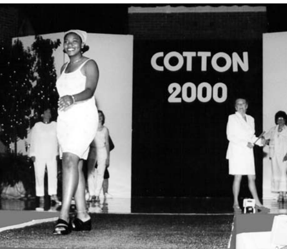
The last Fashion Show in 2000. Can you identify the lady?