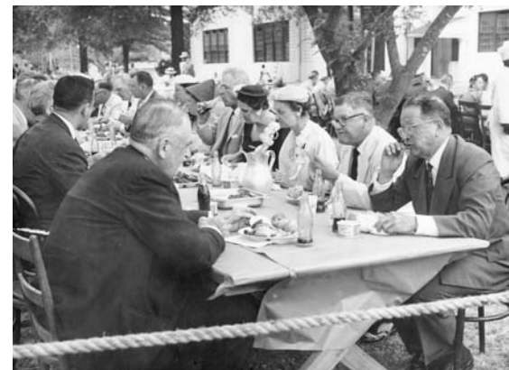
1955 Annual Meeting with Governor Hugh White (left) and Congressman Jamie Whitten (right).