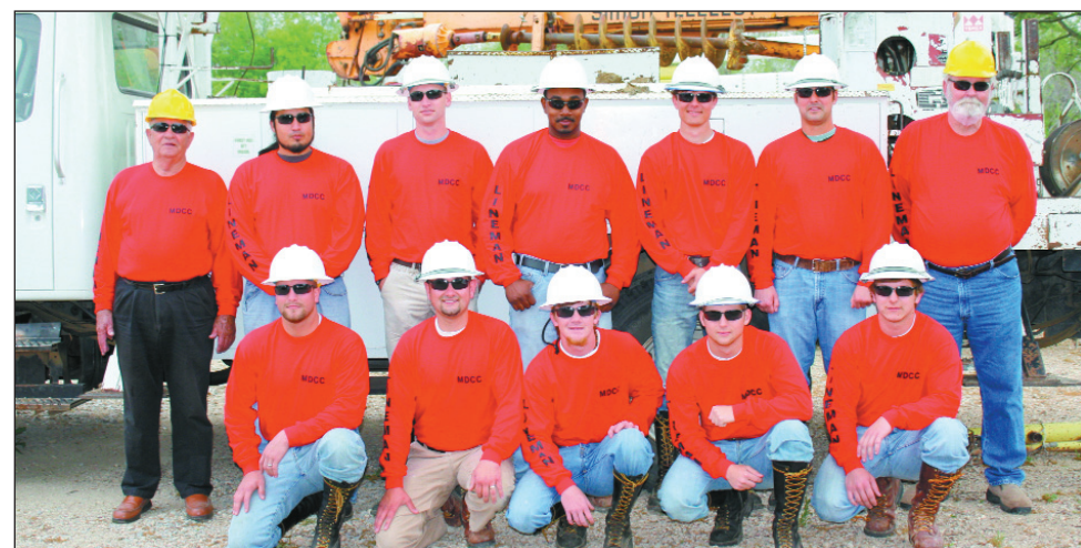
MDCC's 2nd Electrical Lineman Training Class

The 2011 NADO Innovation Award winners will be honored at the Showcase Reception at NADO's Annual Training Conference, to be held in Miami, Florida in October. South Delta Planning and Development District, through the Delta Workforce Investment Board, The Mississippi Department of Employment Security, Delta Electric EPA, Coahoma EPA, Entergy, and Twin County EPA provided funding, equipment, and supplies to create and sustain the program.