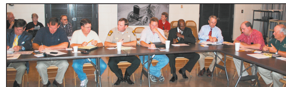
Public officials, emergency management personnel, Levee Board representatives, and others were on hand for a May 23 meeting in Stoneville with representatives from FEMA and MEMA to begin dialogue about post-flood issues, such as access, housing, economic injury, and other response items.

In response to Governor Barbour's request that local officials reach a consensus on modification and completion of Yazoo Basin flood control features, Sullivan asked the Corps of Engineers to present an alternatives analysis of all potential