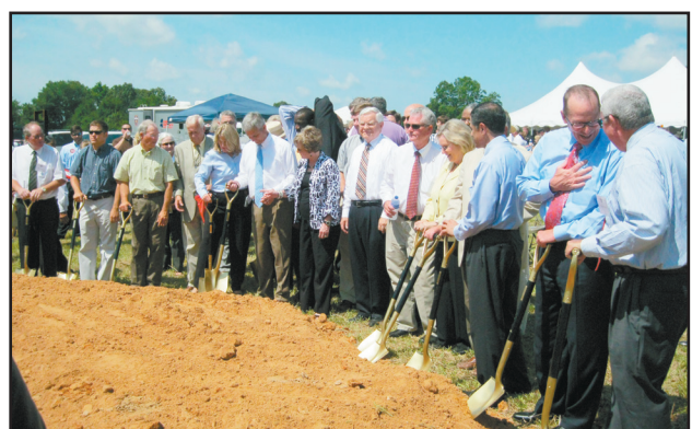
Public officials from throughout North Mississippi and West Tennessee were on hand for the I-269 dedication near the Marshall/DeSoto County line.