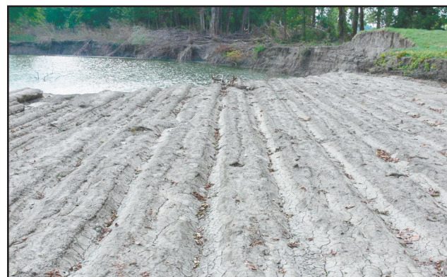
Delta Council President Bowen Flowers recently took this picture of land behind the Mississippi River levee in Coahoma County. As you can see from the photograph, the 2011 Flood eroded several feet of soil. What was revealed under that soil was a perfect bed of cotton rows. Armed with some local knowledge and the fact that the mule prints are visible in the rows, the unearthed field is dated to be 60 to 80 years old when it was probably abandoned due to an earlier flood depositing soil on the field.