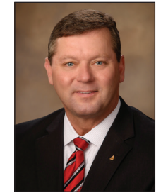
Keith Mitchell Treasurer Grenada