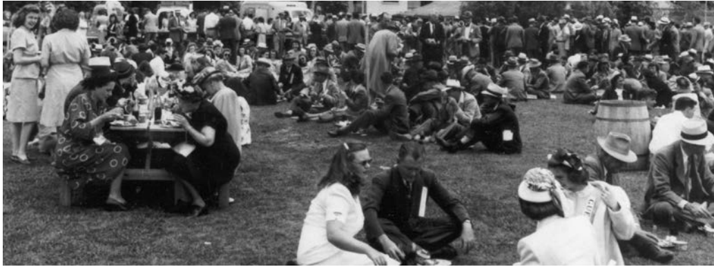
1947 Annual Meeting lunch on the grounds