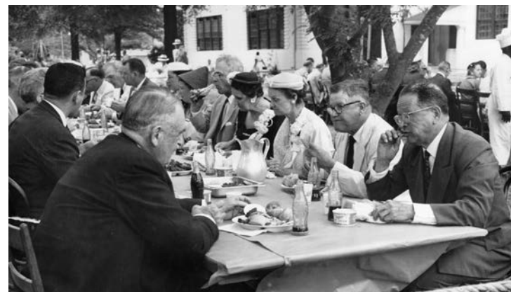
Barbecue chicken luncheon during the Delta Council 1955 Annual Meeting