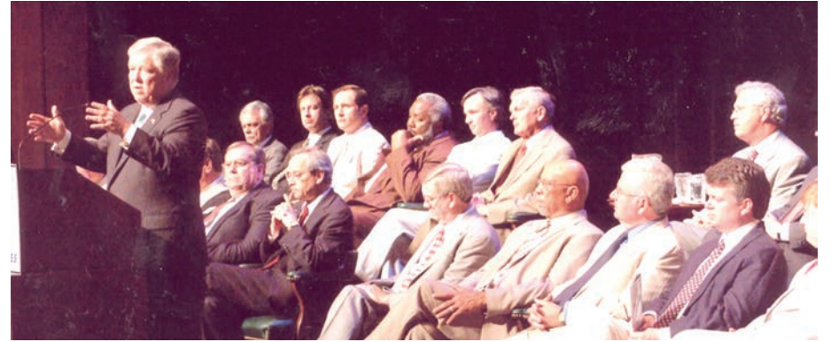
2004 Annual Meeting: Governor Barbour addresses Delta Council audience.