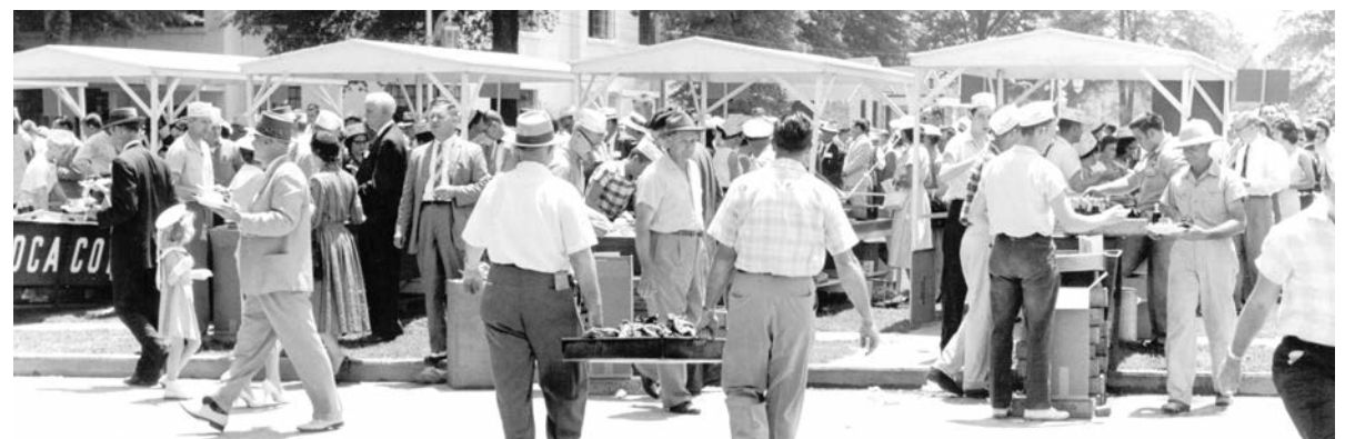
1958 BBQ on the Delta State quadrangle