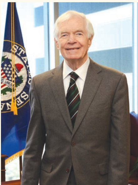
Outstanding Contributions to Aquaculture: Senator Thad Cochran United States Senator (MS)