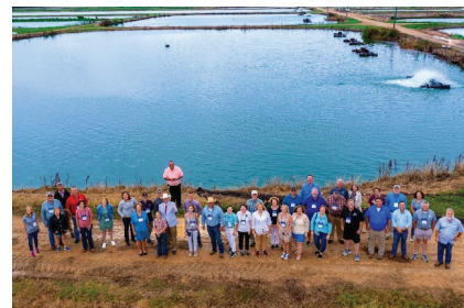
NAAMO members attending the 2021 NAAMO Conference tour the catfish farm and processing facilities of Heartland Catfish in Itta Bena.

The North American Agricultural Marketing Officials (NAAMO) presented Mississippi-based Heartland Catfish Company with the Agricultural Marketer of the Year Award during its annual conference hosted by the Mississippi Department of Agriculture and Commerce.